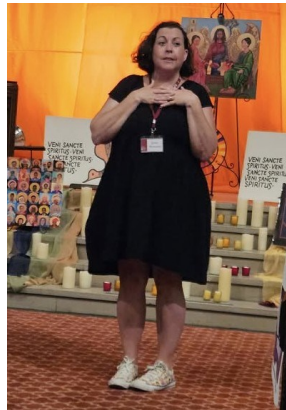
Vacation Church school with East Liberty Presbyterian Church in June