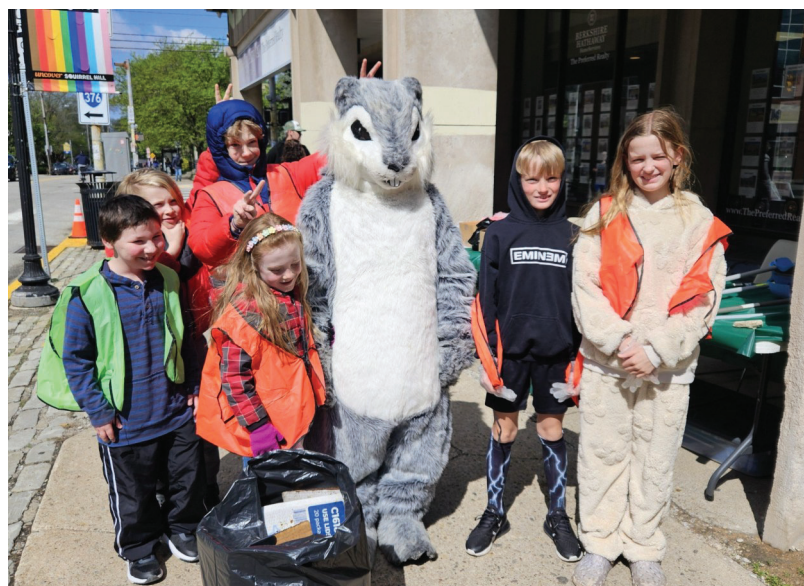
Sunday School students participated in the recent Squirrel Hill Clean-up Patrol. During the Sunday school hour they picked up enough to fill a large garbage bag!