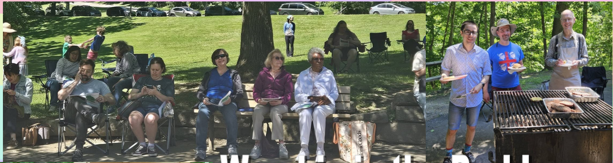
Worship in the Park!