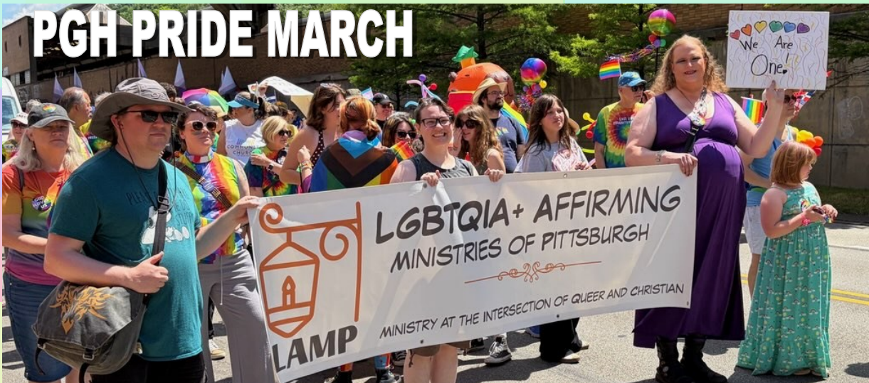
PGH PRIDE MARCH